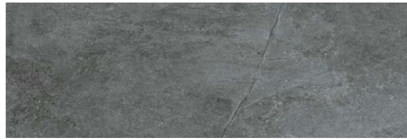
Wells Ash 33,3x100 Rec. M48 031.627.0344.06159