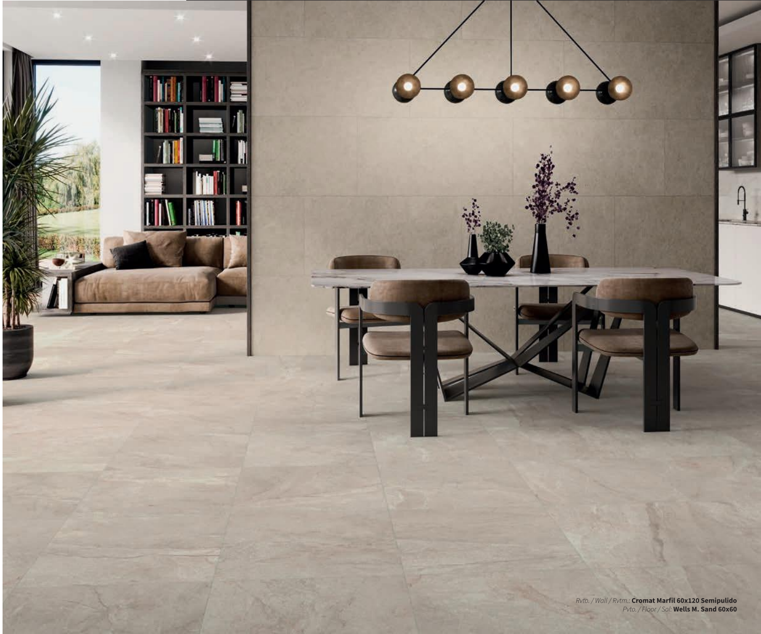
Rvto. / Wall / Rvrm.: Cromat Marfil 60x120 Semipulido Pvto. / Floor / Sal.: Wells M. Sand 60x60