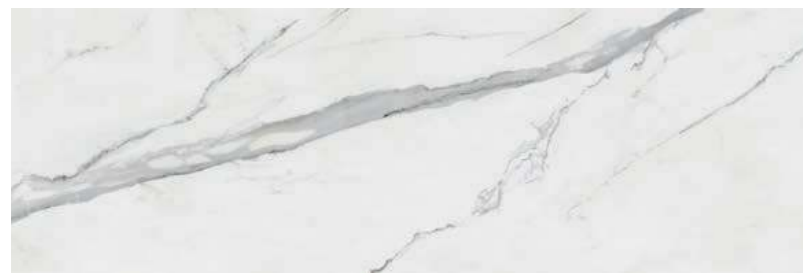
Cellini Brillo 33,3x100 Rec. M48 031.627.0804.09556