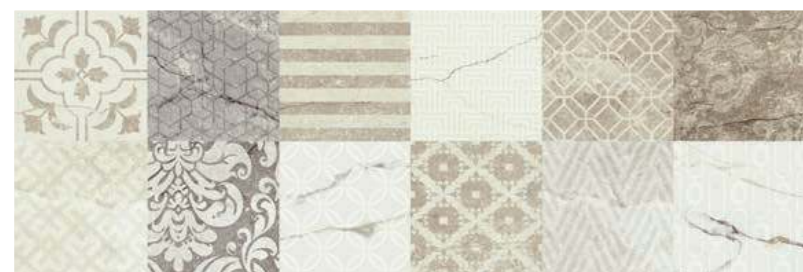
Oasis Mix 33,3x100 Rec. M48 031.627.0100.10100