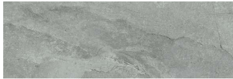
Wells Pearl 33,3x100 Rec. M48 031.627.0169.06159