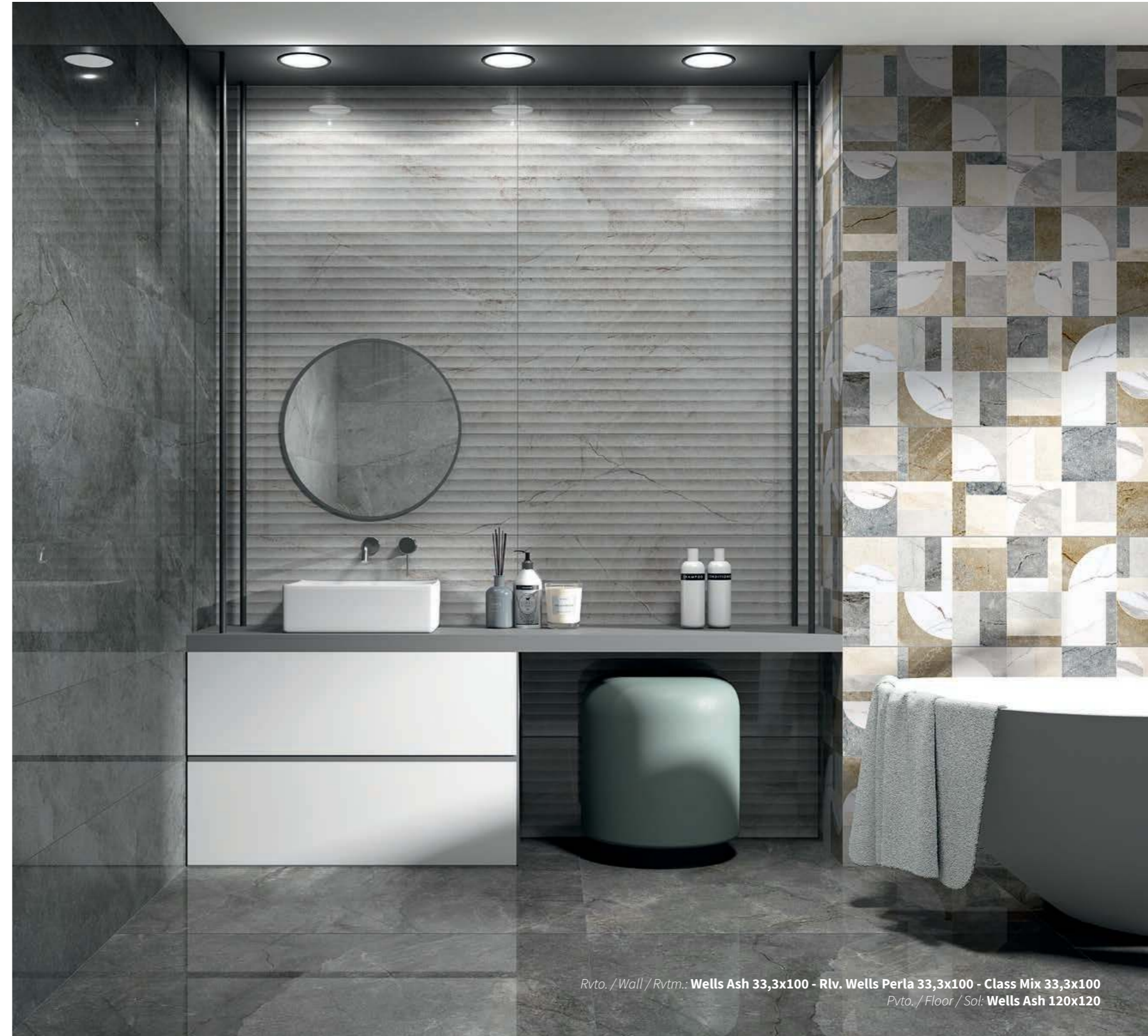
Rvto. / Wall / Rvrm.: Wells Ash 33,3x100 - Rlv. Wells Perla 33,3x100 - Class Mix 33,3x100 Pvto. / Floor / Sol: Wells Ash 120x120

Piezas especiales / Special pieces / Pièces especiales (No Rlv. / No Dec.)