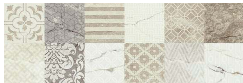
Oasis Mix 33,3x100 Rec. M48 031.627.0100.10100