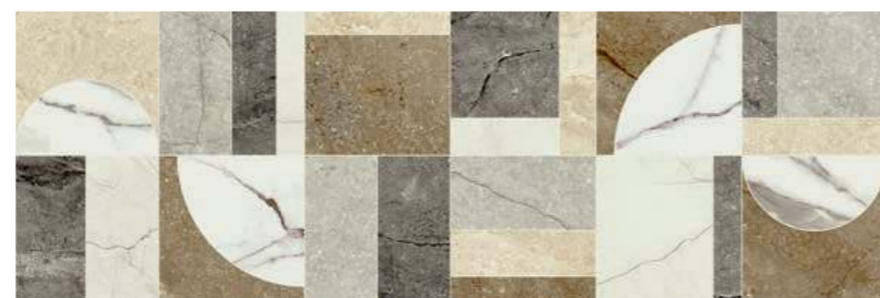
Class Mix 33,3x100 Rec. M48 031.627.0100.10354