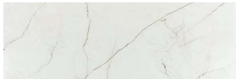
Desert Natural 33,3x100 Rec. M48 031.627.0102.04037