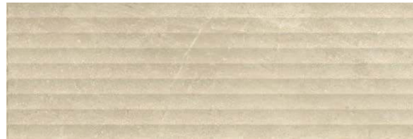
Rlv. Wells Cream 33,3x100 Rec. M48 031.627.0163.10099