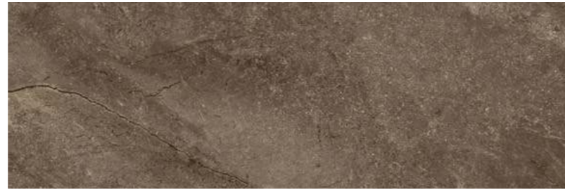
Wells Moka 33,3x100 Rec. M48 031.627.0240.06159