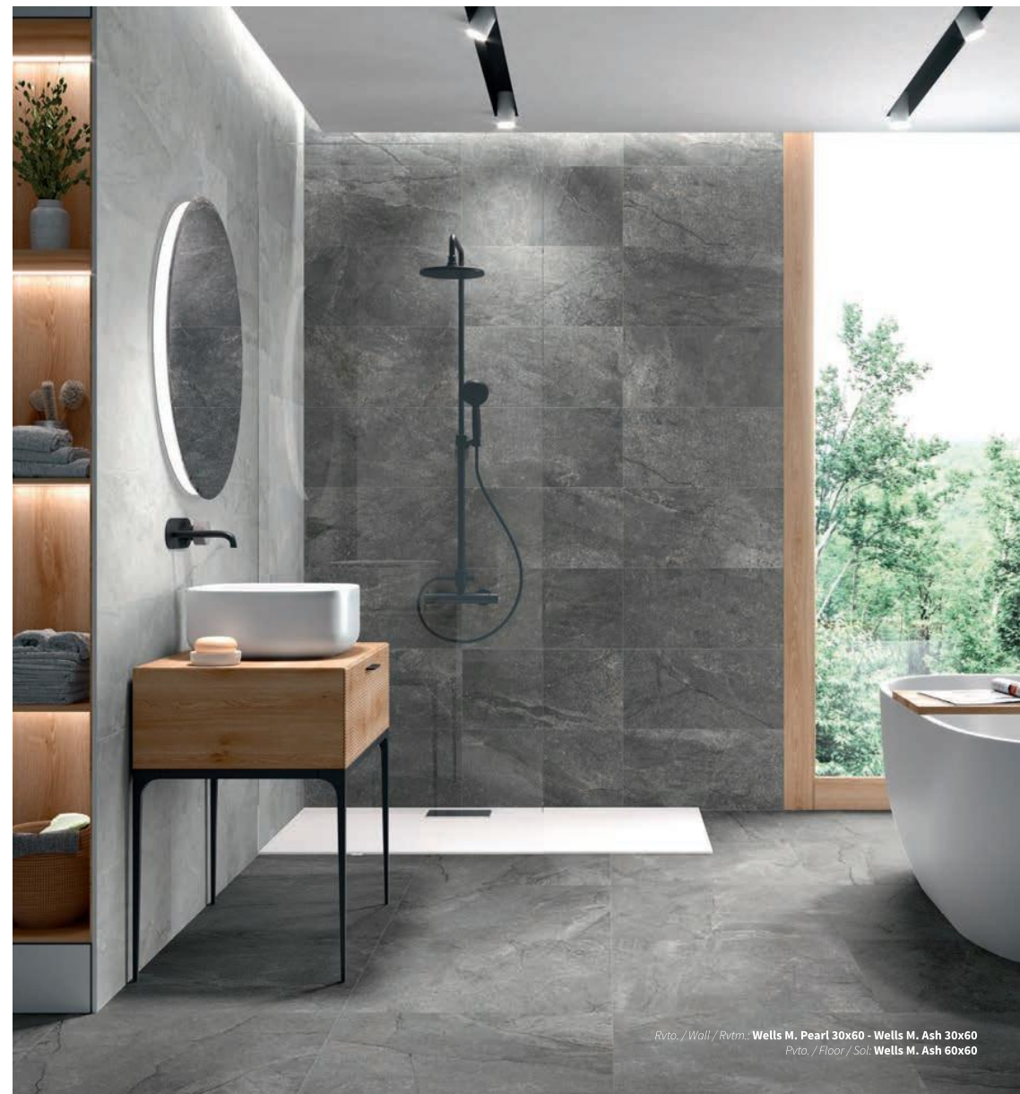
Rvta. / Wall / Rvrm.: Wells M. Pearl 30x60 - Wells M. Ash 30x60 Pvta. / Floor / Sol.: Wells M. Ash 60x60

LEVIGLASS GRES PORCELÁNICO ESMALTADO PULIDO RECTIFICADO · POLISHED GLAZED RECTIFIED PORCELAIN TILES · GRÈS CÉRAMÉ ÉMAILLÉ POLI RECTIFIÉE