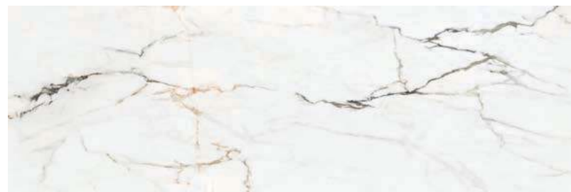
Torano Brillo 33,3x100 Rec. M48 031.627.0804.09878