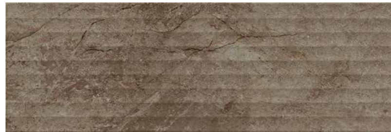
Rlv. Wells Moka 33,3x100 Rec. M48 031.627.0240.10099