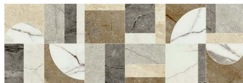
Class Mix 33,3x100 Rec. M48 031.627.0100.10354