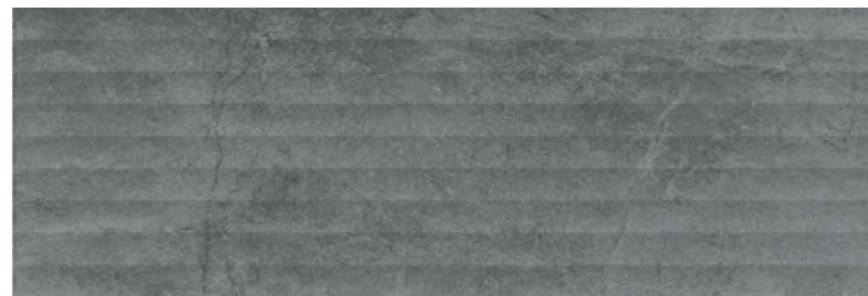
Rlv. Wells Ash 33,3x100 Rec. M48 031.627.0344.10099