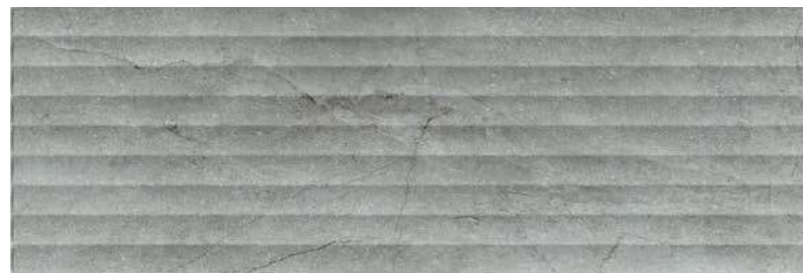
Rlv. Wells Pearl 33,3x100 Rec. M48 031.627.0169.10099