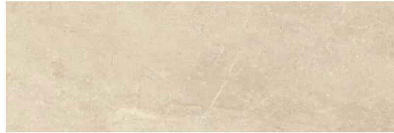
Wells Cream 33,3x100 Rec. M48 031.627.0163.06159