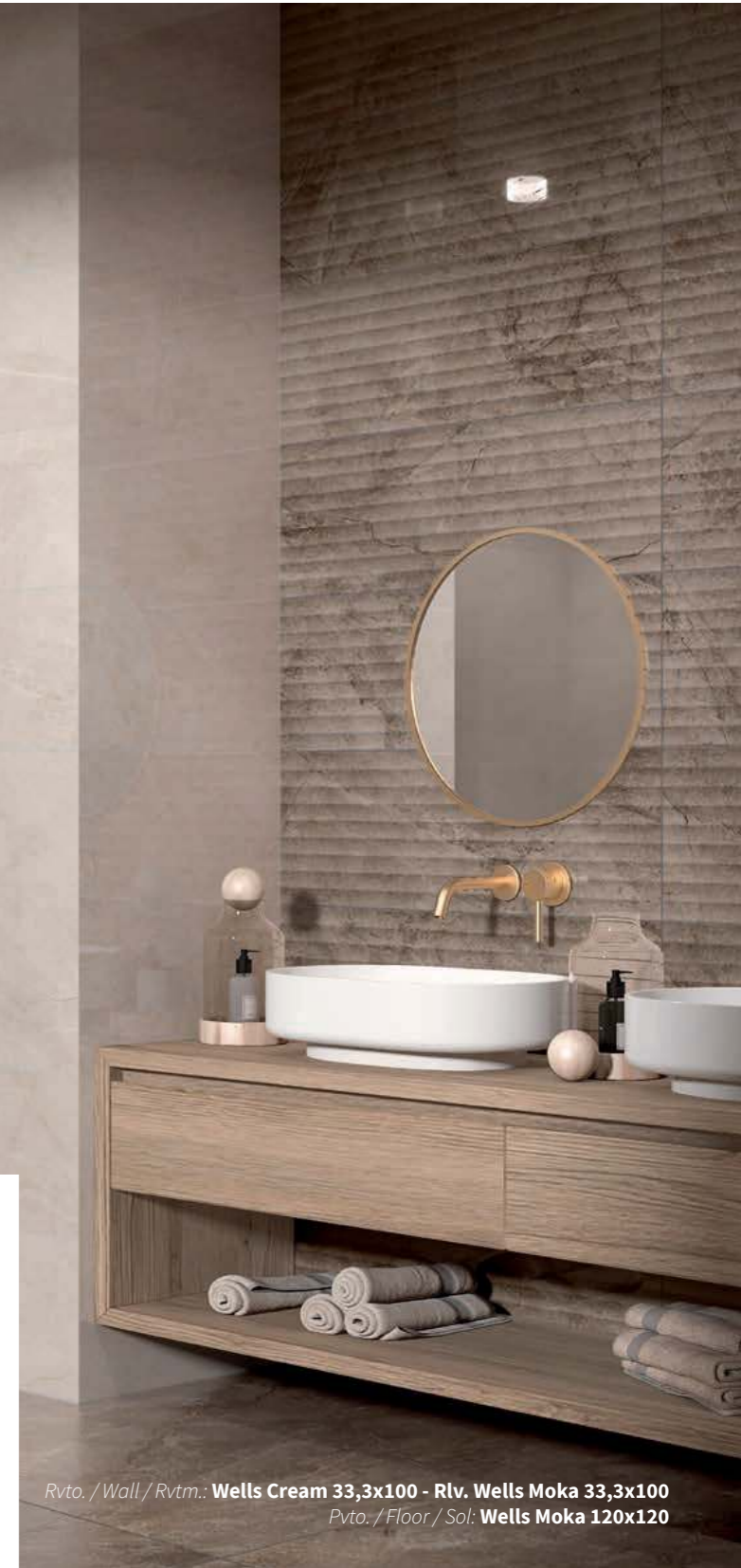
Rvto. / Wall / Rvrm.: Wells Cream 33,3x100 - Rlv. Wells Moka 33,3x100 Pvto. / Floor / Sol: Wells Moka 120x120